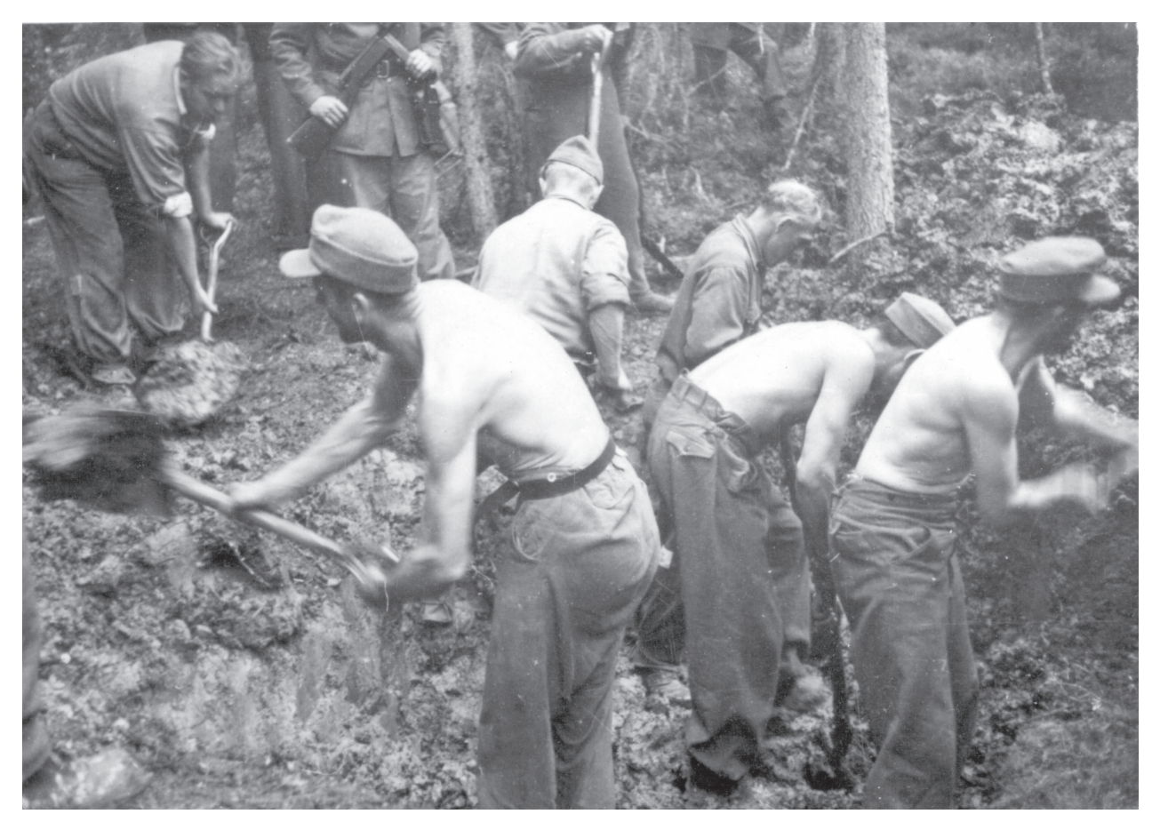
Figure 3. German prisoners exhuming graves in the Falstad Forest after liberation of the camp

It is estimated that at least 100 Soviet POWs, 74 Yugoslavian and 43 Norwegian political prisoners, and several Jewish men were killed and buried at the site (Reitan 2006, 47). The task of digging the graves before planned executions was often delegated to prisoners of the camp. Some of those requisitioned to prepare the graves survived the war, like the Serbian prisoner Ljuban Vukovic, who later gave an account of his work. The operation of May 1945 was, therefore, an attempt to erase the presence of both bodies and the graves – but also one countered by the memory of the former inmates and the material presence of buried remains, neither of which the Nazis managed to destroy.