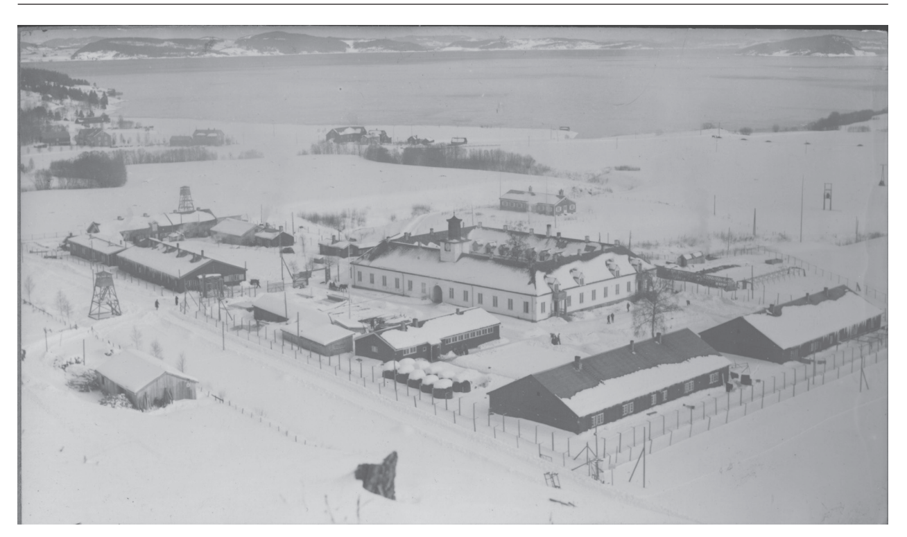
Figure 1. The Falstad Camp after liberation.

Oslo, and the SS Straffgefangelerlager Falstad , the biggest prison camp established in Central Norway.