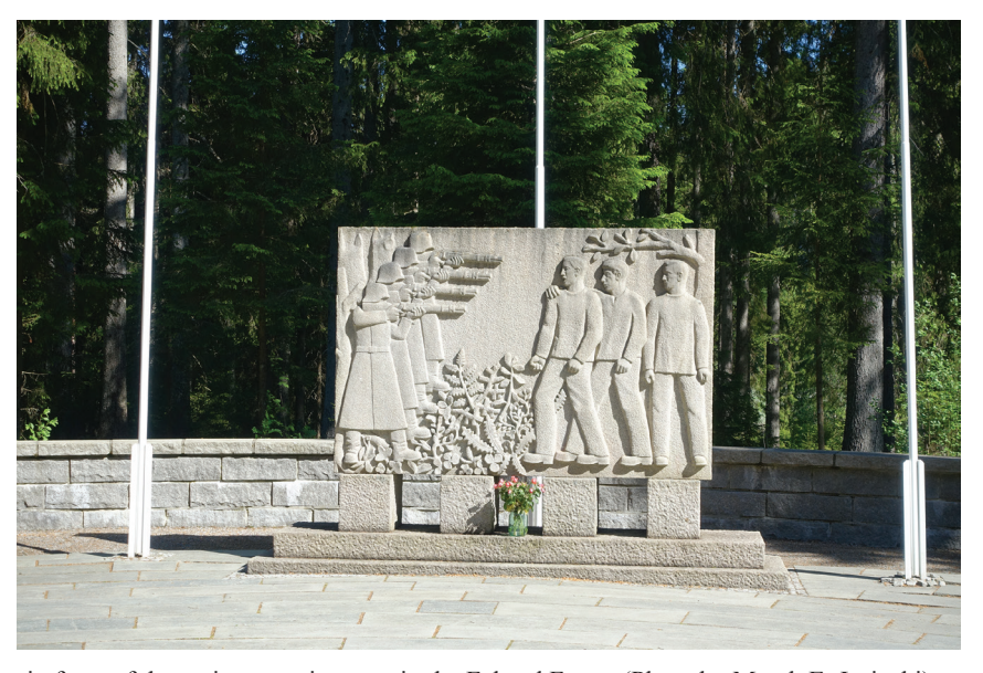
Figure 2. Monument in front of the main execution area in the Falstad Forest.

Transformed into both an execution ground and a burial site for murdered inmates, the forest constituted the darkest element of the Falstad landscape. It was there that the prisoners were placed on the edge of a prepared grave and murdered by a gunshot to the neck or head from a pistol. This method of killing was confirmed in 2018 by two surface finds discovered during a short one-day archaeological trial survey of a selected area carried out in 2018 by the present authors. The two objects were an unfired pistol round, caliber 9 mm and a casing of fired round of the same caliber both of German production dated to the 1930s.