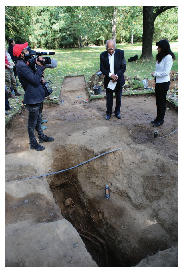
Figure 11. Camp cemetery. Memorial act organized by the Museum of Romani Culture on 11<sup>th</sup> September, which was attended by the relatives and descendants of the victims.

monument by academic sculptor and painter Zdenek Hůla but is mostly situated in its north-western vicinity. Outcomes of the research will be used in the planned adaptation of the cemetery. In accordance with the requirements of the survivors' relatives and the Museum of Romani Culture representatives, two graves were excavated in order to ascertain preservation of human remains and the form of burial. Human remains were not exhumed and anthropological analysis was carried in situ (Kwiatkowska 2019) and samples for subsequent genetic analysis were also taken (Molak 2020). Grave I contained a young woman who died before the age of 40 and was buried in the wooden coffin in a crouching position. Fragments of the wooden coffin were found without any preserved human remains in Grave III, a very small and shallow grave where it is likely that a baby under one year of age was buried (Kwiatkowska 2019). The poor conditions for the preservation of the skeletal remains of small children are caused by soil conditions but also the fact that the graves were sprinkled with quicklime. Relatives and descendants of the victims were present during excavations and a memorial service was organized on the site by the Museum of Romani Culture on September 11, 2019 (Fig. 11).