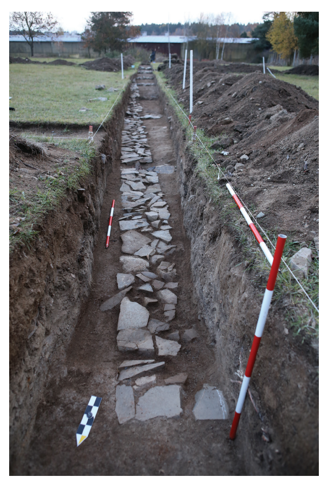
Figure 5. Intervention 10. View from the north to the uncovered north-eastern corner and the eastern part of the large prisoners' barracks ( 9 \times 28 m).