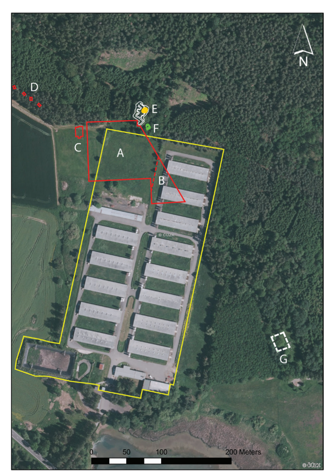
Figure 2. Localization of the Roma detention camp and the camp cemetery. Red line – camp area ( A. Archaeologically preserved camp area; B. Part of the camp area destroyed during construction of the pig farm; C. Headquarters/administrative building; D. location of the camp guards' barracks; E. Antiair-raid trenches; F. Surface remains of camp cellar; G. Camp cemetery (localization based on archival evidence and archaeological research), yellow – industrial pig farm area (map by P. Vařeka, orthophoto map by ArcGIS on ags.cuzk.cz).

life and living conditions in the camp. The set of findings seems also to comprise confiscated and discarded belongings brought to the camp by the inmates which uniquely reflect the material culture of the Roma and Sinti of the period. Due to the specific soil conditions (wet sediments without air access), artefacts from organic material have also been uniquely preserved, such as fragments of wooden constructions, textile and leather clothing and footwear. Evidence of shaving and cutting prisoners' hair, which includes hair and even an entire plait, provides a stark testimony to the forced transformation of human beings into prisoners (Figs 8-10). Analysis of fragments of animal bones and macro-botanic remains from the camp shed a new light on the prisoners' diet and document desperate attempts – probably undertaken during periods of forced labor outside the camp – to get anything to eat, such as wild berries, wild fruits and small animals (Kočár and Kočárová 2020; Sůvová 2020). The only surface remains of the camp were identified in the woods close to the northern edge of the pig farm. A combination of archaeological research