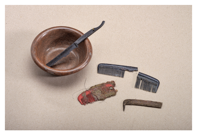
Figure 10. Shaving bowl, razor and combs (plastic and iron; cesspit fill).

cluding adults, adolescents (grave I, II, IV, VI, VII, VIII) and small children (grave III, V).