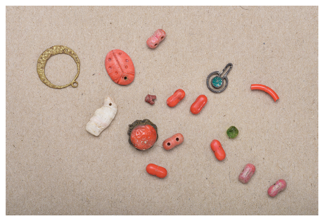
Figure 9. Earrings, hair clips, beads and other components of necklaces (gold, silver and glass; cesspit fill; photo by I. Ibrahimovič).

the archival evidence. A total of 120 camp victims were inhumed here, including 77 children, between January 16 and April 23 1943 (Nečas 1999: 63). The exact location of the burial ground vanished in the post-war period. The memorial to the victims of the Roma internment camp in Lety was established in 1995 on the site which, as it was believed, more or less corresponded to the location of the cemetery. Archaeological research comprised topographic survey, aerial photographs from a drone, geophysical survey and trial excavations. Geomagnetic, electric-resistance and ground penetration radar survey did not produce any convincing evidence regarding grave-pits due to extensive ground disturbance around the memorial by service trenches and pipes from the watering system (Křivánek 2016; Mitchell and Colls 2019, 34-38; Vágner 2019). However, relevant results were gained by archaeological intervention located 8 meters west from the memorial. Excavations over an area of 38 m<sup>2</sup> revealed the south-west section of the camp cemetery, indicated by margins of eight grave-pits formed in rows of various sizes. This suggested that there was an age difference between buried individuals very likely in-