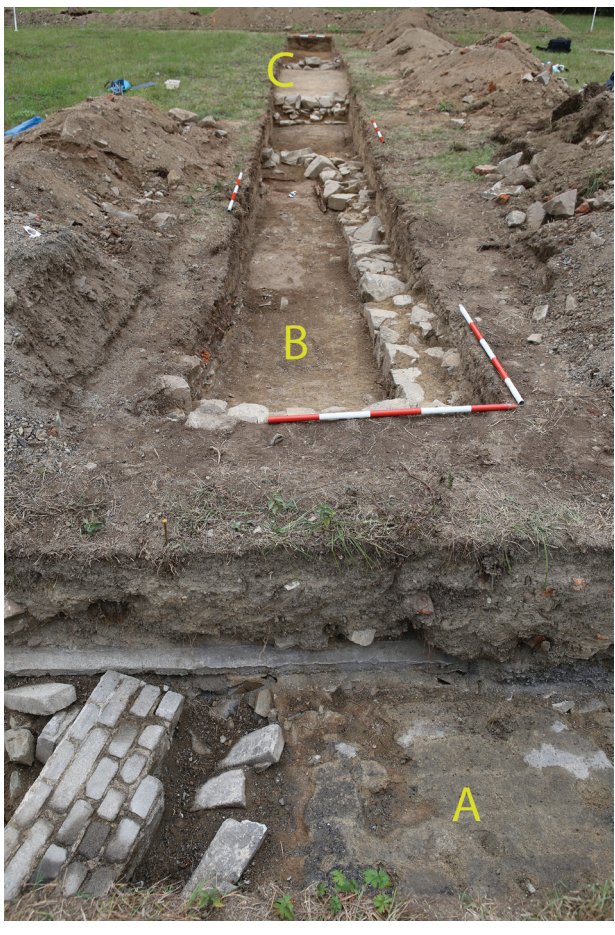
Figure 6. Intervention 6 and 12. Remains of the washroom/laundry ( A ), stable ( B ) and delousing station ( C ).