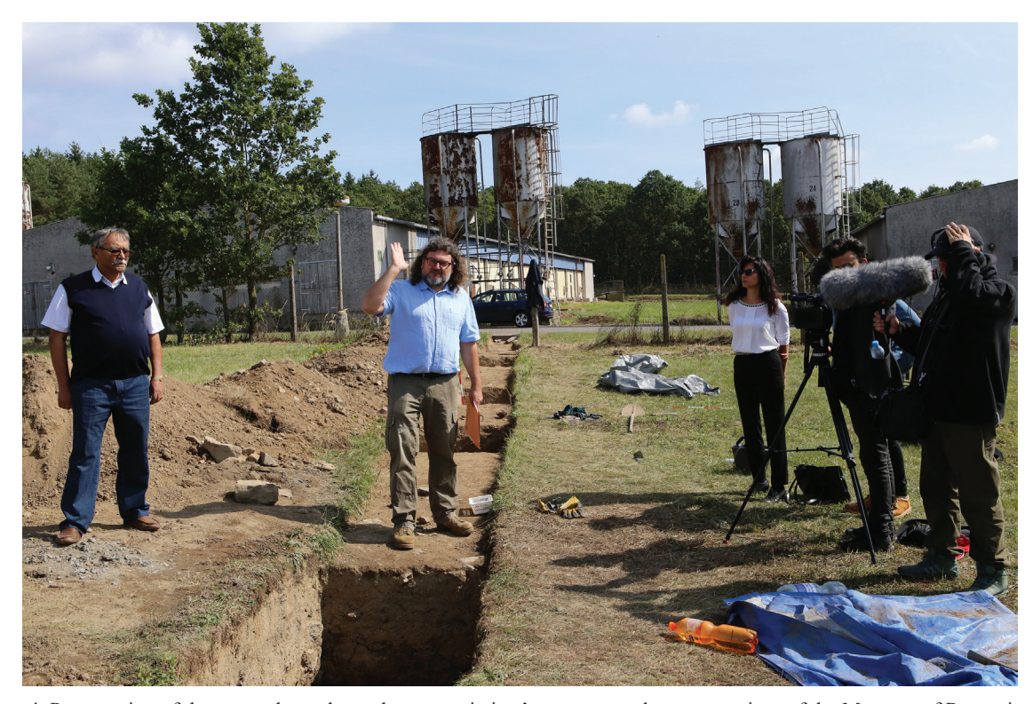
Figure 4. Presentation of the research results to the camp victims' ancestors and representatives of the Museum of Romani culture.