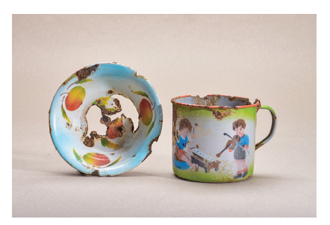
Figure 8. Enamel dishes for babies (cesspit fill).

the archival evidence. A total of 120 camp victims were inhumed here, including 77 children, between January 16 and April 23 1943 (Nečas 1999: 63). The exact location of the burial ground vanished in the post-war period. The memorial to the victims of the Roma internment camp in Lety was established in 1995 on the site which, as it was believed, more or less corresponded to the location of the cemetery. Archaeological research comprised topographic survey, aerial photographs from a drone, geophysical survey and trial excavations. Geomagnetic, electric-resistance and ground penetration radar survey did not produce any convincing evidence regarding grave-pits due to extensive ground disturbance around the memorial by service trenches and pipes from the watering system (Křivánek 2016; Mitchell and Colls 2019, 34-38; Vágner 2019). However, relevant results were gained by archaeological intervention located 8 meters west from the memorial. Excavations over an area of 38 m<sup>2</sup> revealed the south-west section of the camp cemetery, indicated by margins of eight grave-pits formed in rows of various sizes. This suggested that there was an age difference between buried individuals very likely in-