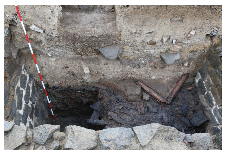
Figure 7. Intervention 7, sector D, extension. Cesspit lined with granite blocks; northern part excavated to the bottom; two different parts of the fill can be seen on the profile – the upper dry part was deposited after the camp's liquidation and the lower wet one from the period of the camp's existence (view from the west, photo by P. Vařeka).