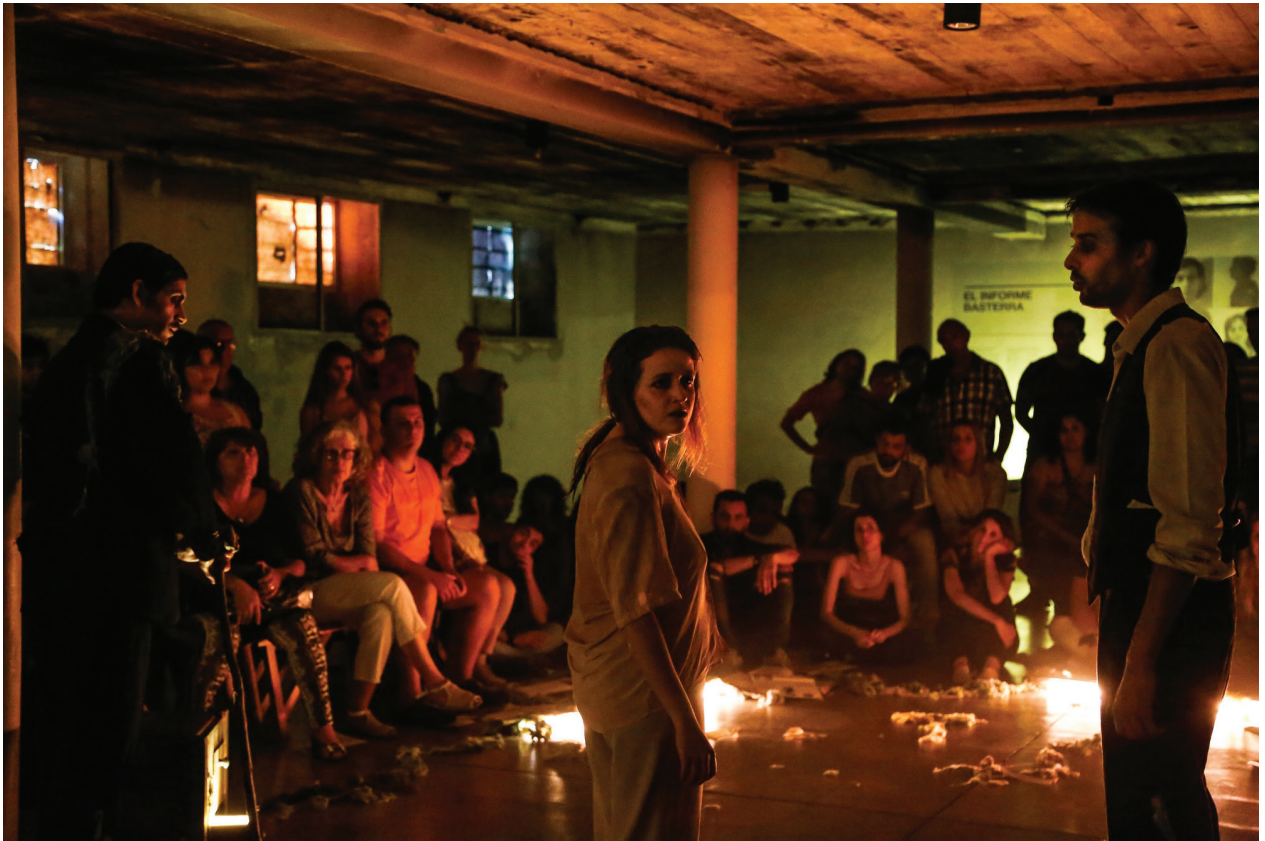
Figure 11. Voices of the River (ESMA Museum and Site of Memory).