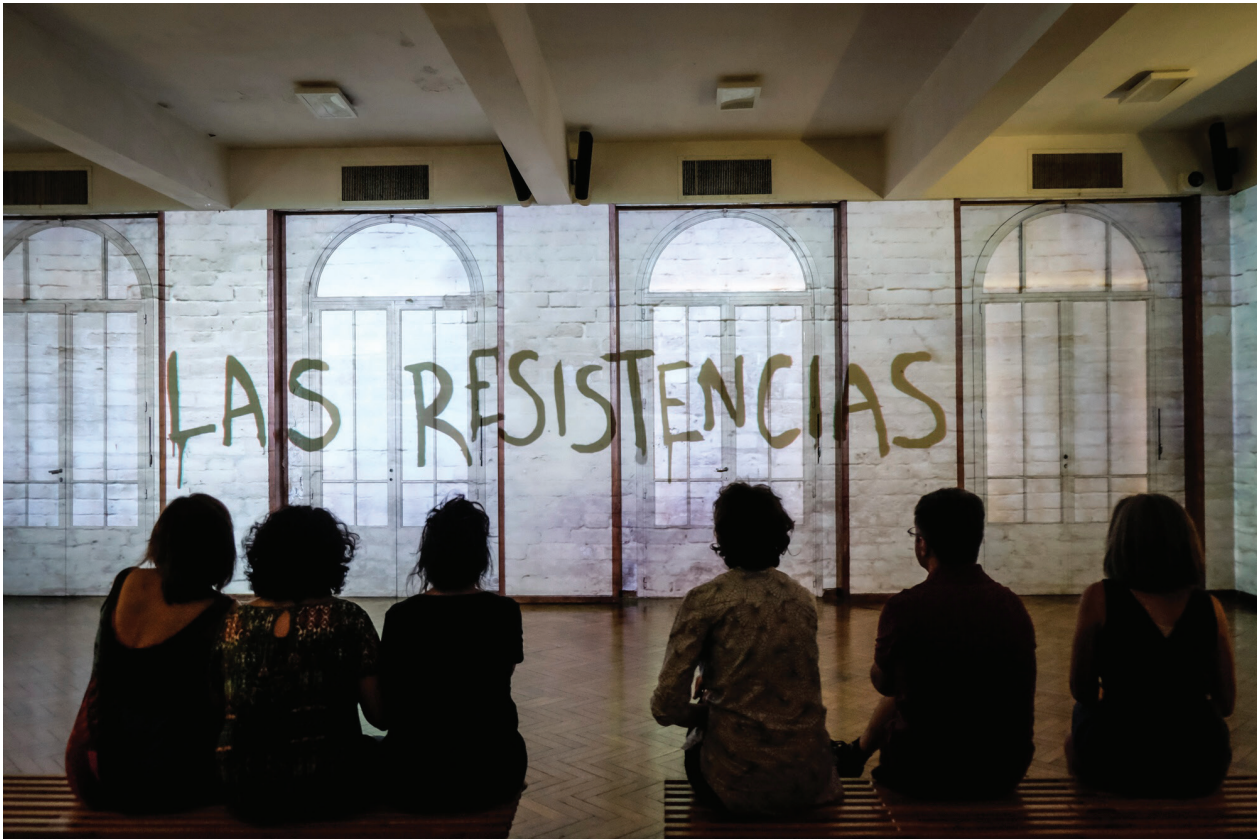
Figure 4. Context room. (ESMA Museum and Site of Memory).

floor, it guides the visitor and it hides the technical installations since we could not carry out any alterations to the building. The walkway guides the visitor closer and further away from the exhibits to evoke changing emotions. We decided to make the walkway out of wood, which is a warm, soft element. It helps the visitor get closer to the experience, but we also wanted to provide room for reflection and distance. Therefore, just as we did not rebuild a concentration camp, we were not going to build anything aesthetically unappealing. We employed beauty as an ethical and aesthetic concept that would contribute to our goal of transmitting a legacy and a memory.