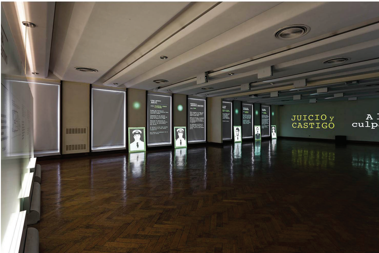
Figure 7. “Dorado” room. (ESMA Museum and Site of Memory).

floor. Between them, we wanted to place a rainfall of water that came out from 30,000 pores and project the only photos we have of this place during the dictatorship taken by a former detainee. However, we were not able to reach consensus about this installation as it was unacceptable to several survivors and victim families. This exemplifies that the tensions between artistic languages and the vision of the victims can be contradictory and ambivalent. Therefore, we say that the Museum is an ongoing project. This is fruitful for the connection between the educational and emotional realms that are present in the stories we wish to tell.