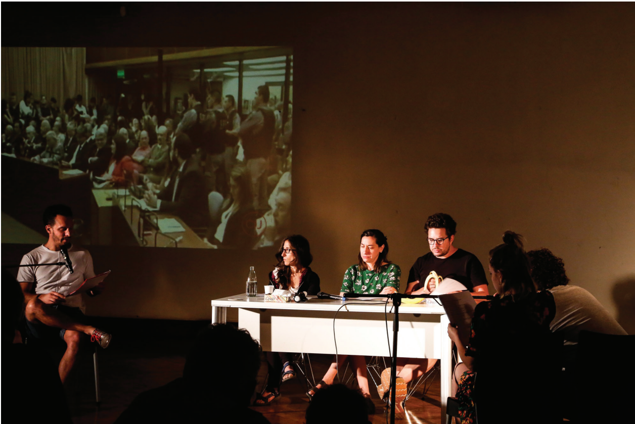
Figure 13. Adjournment (ESMA Museum and Site of Memory).