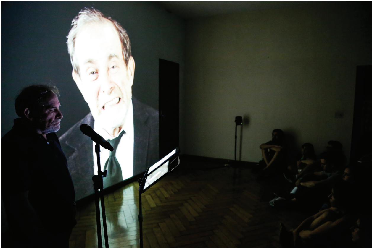
Figure 10. The Impossible Scene (ESMA Museum and Site of Memory).

will move towards the historical context, where the public will settle on the seats and the floor to watch the full screening. Once the video is over, the first act of the play begins. Then we will move on to the ESMA History sector, where the tour continues and we will proceed to the basement. There will be another section of the play. We will immediately go up to the golden room, where the rest of the play is performed (Martín Paglione, November 2019; Buenos Aires, Argentina).