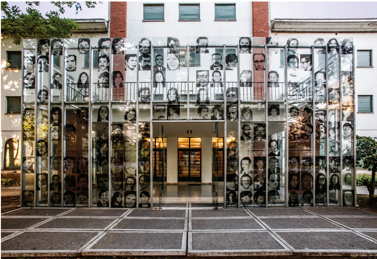
Figure 1. Museum façade. (ESMA Museum and Site of Memory).

The Museum consists of two museal devices in order to distinguish between historical fact and interpretation: