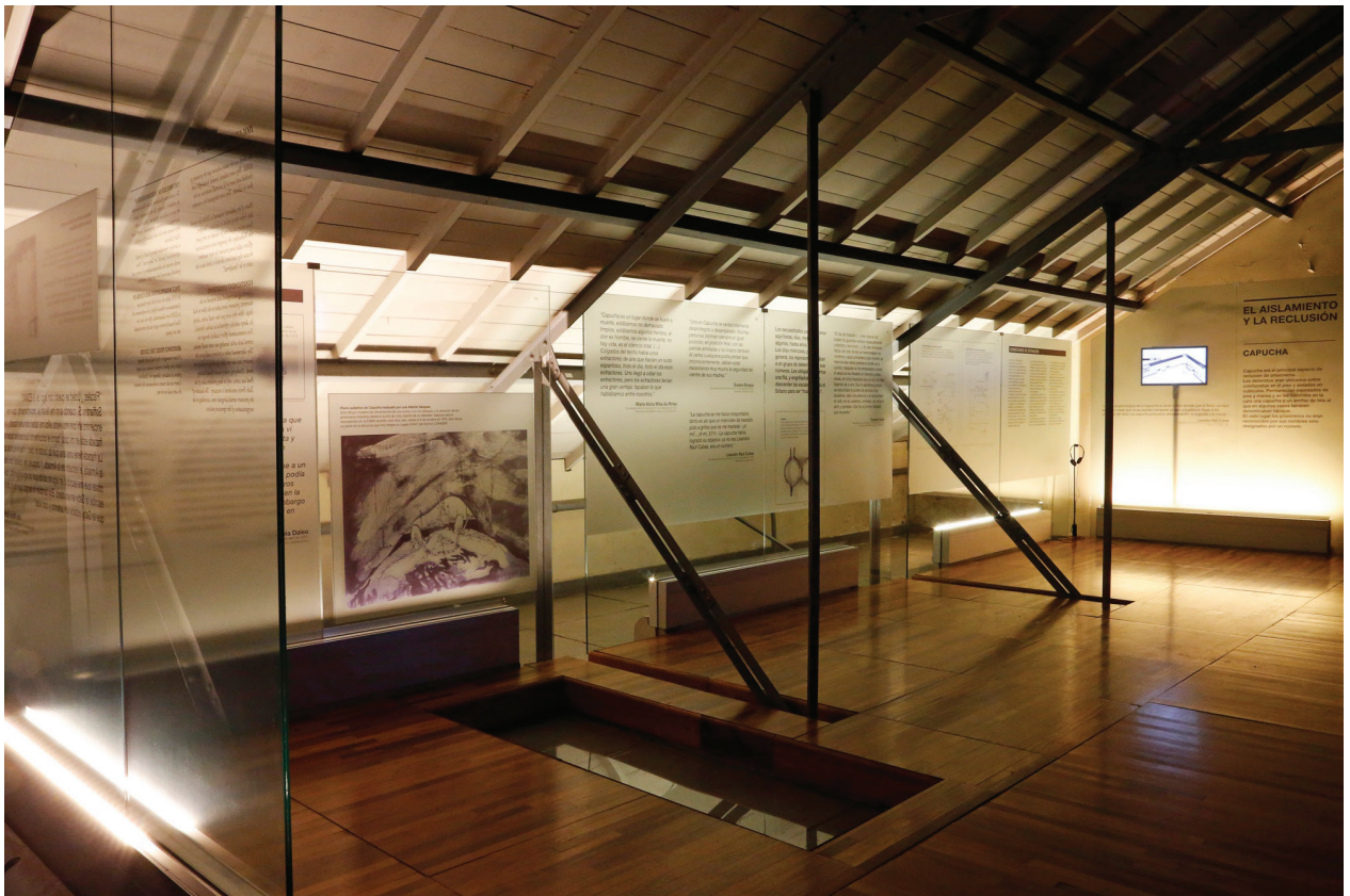
Figure 5. Third floor, Capucha. (ESMA Museum and Site of Memory).