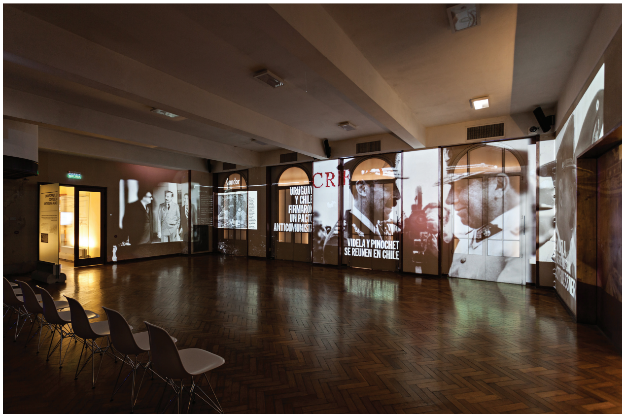
Figure 3. Context room. (ESMA Museum and Site of Memory).

tatorship that features archive footage providing context about the politics, economics and culture that led to the coup of 24 March 1976, the resistance to the dictatorship and the fight of human rights organisations and other sectors of society in the search for memory, truth and justice. The film reflects the way in which we curators wanted to use artistic interpretations in the Museum. We use art as a communicative and transmissive tool.