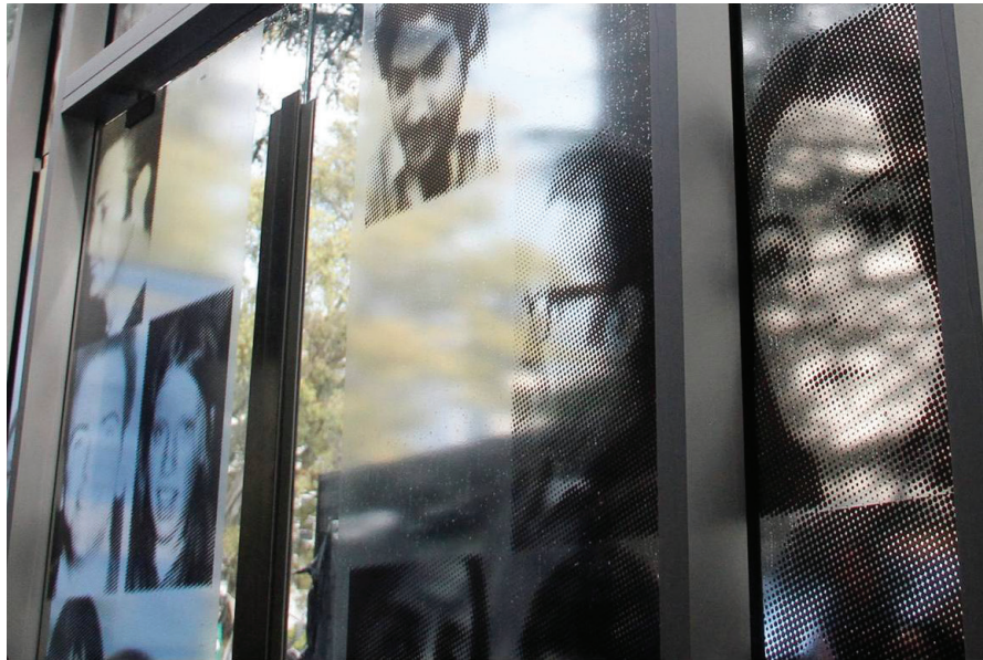
Figure 2. Museum façade. Detail. (ESMA Museum and Site of Memory).