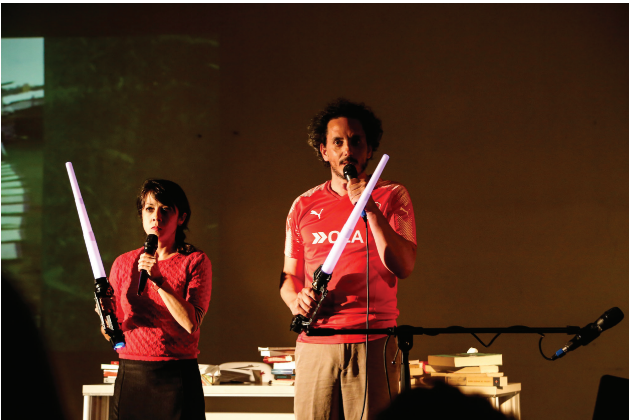
Figure 14. Adjournment (ESMA Museum and Site of Memory).