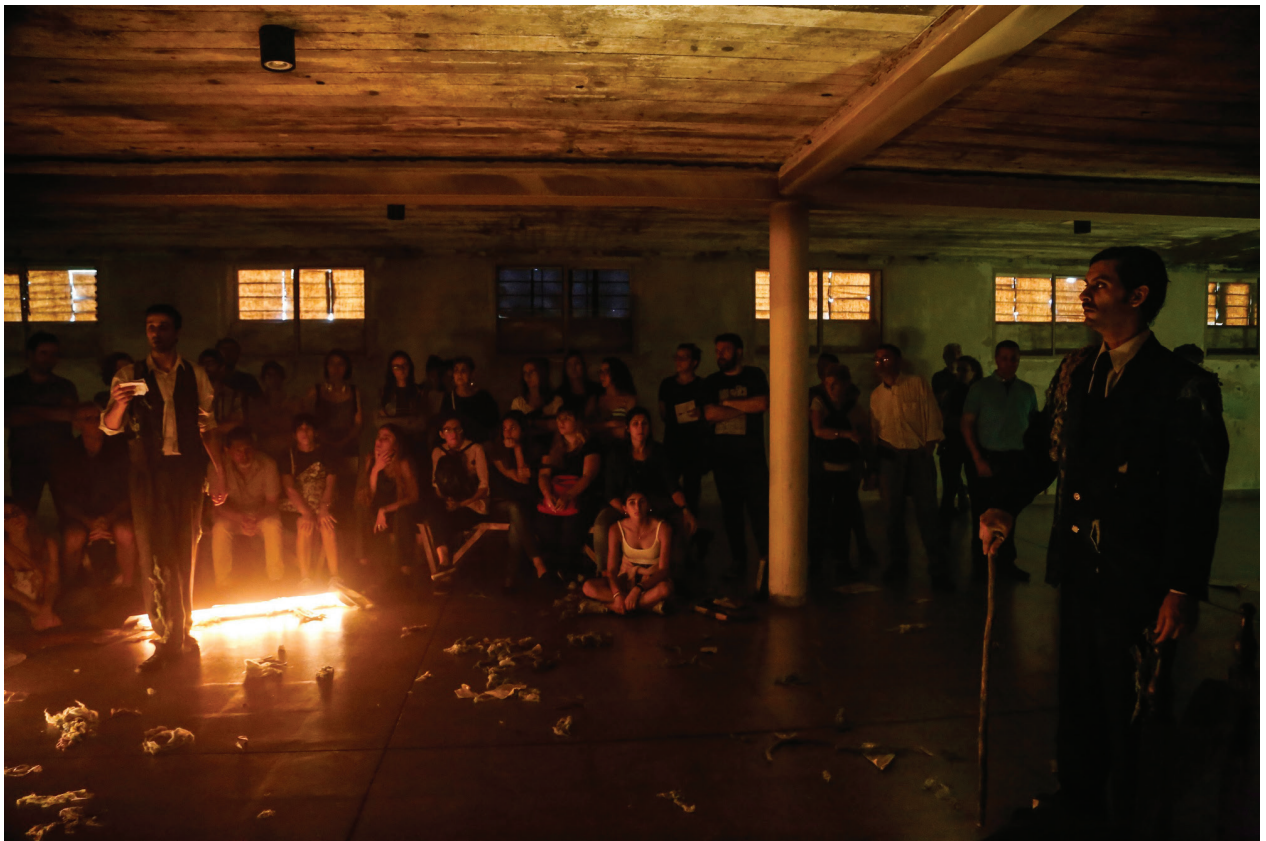
Figure 8. Voices of the River (ESMA Museum and Site of Memory).