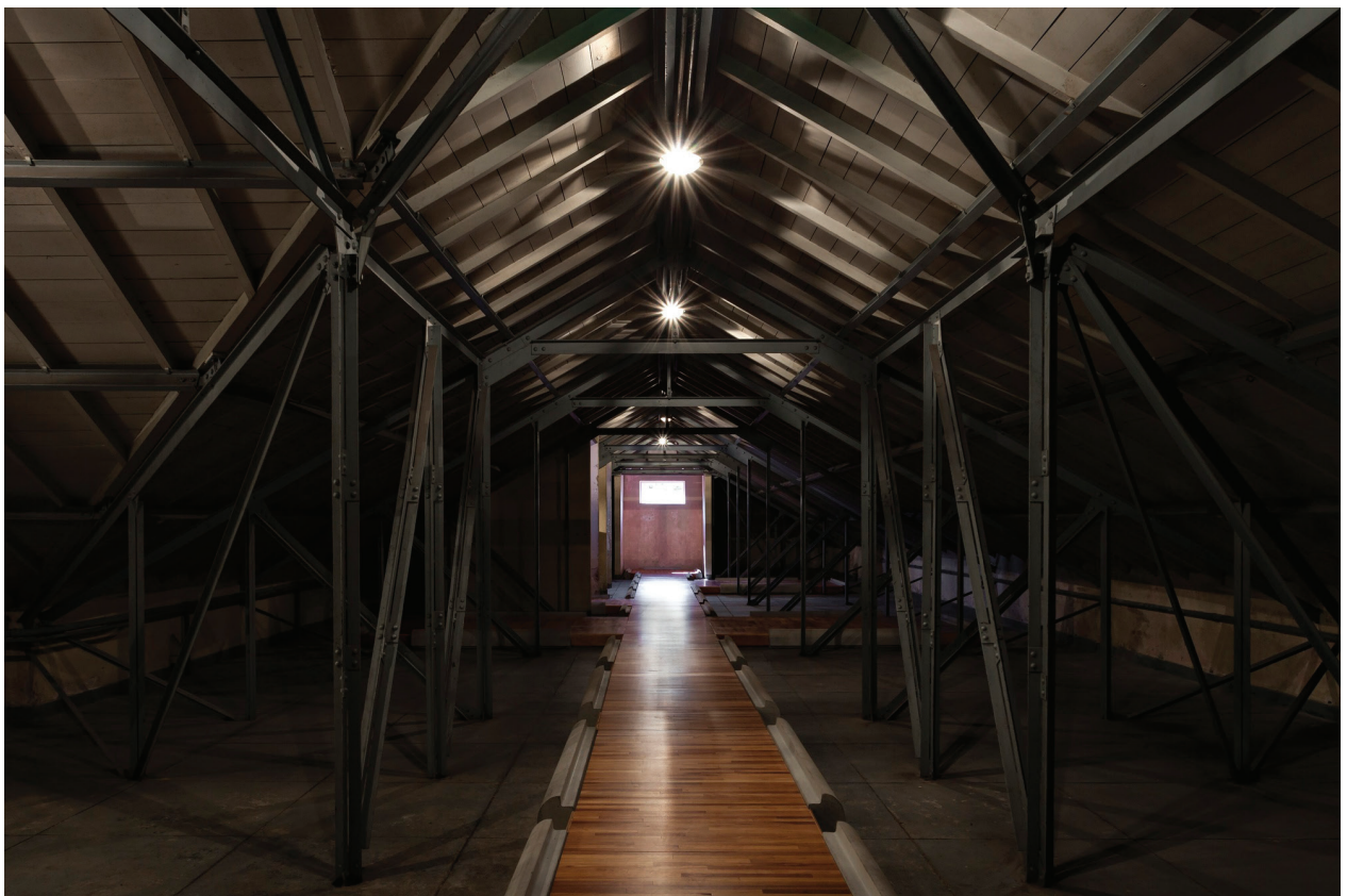
Figure 6. Third floor, Capucha (ESMA Museum and Site of Memory).