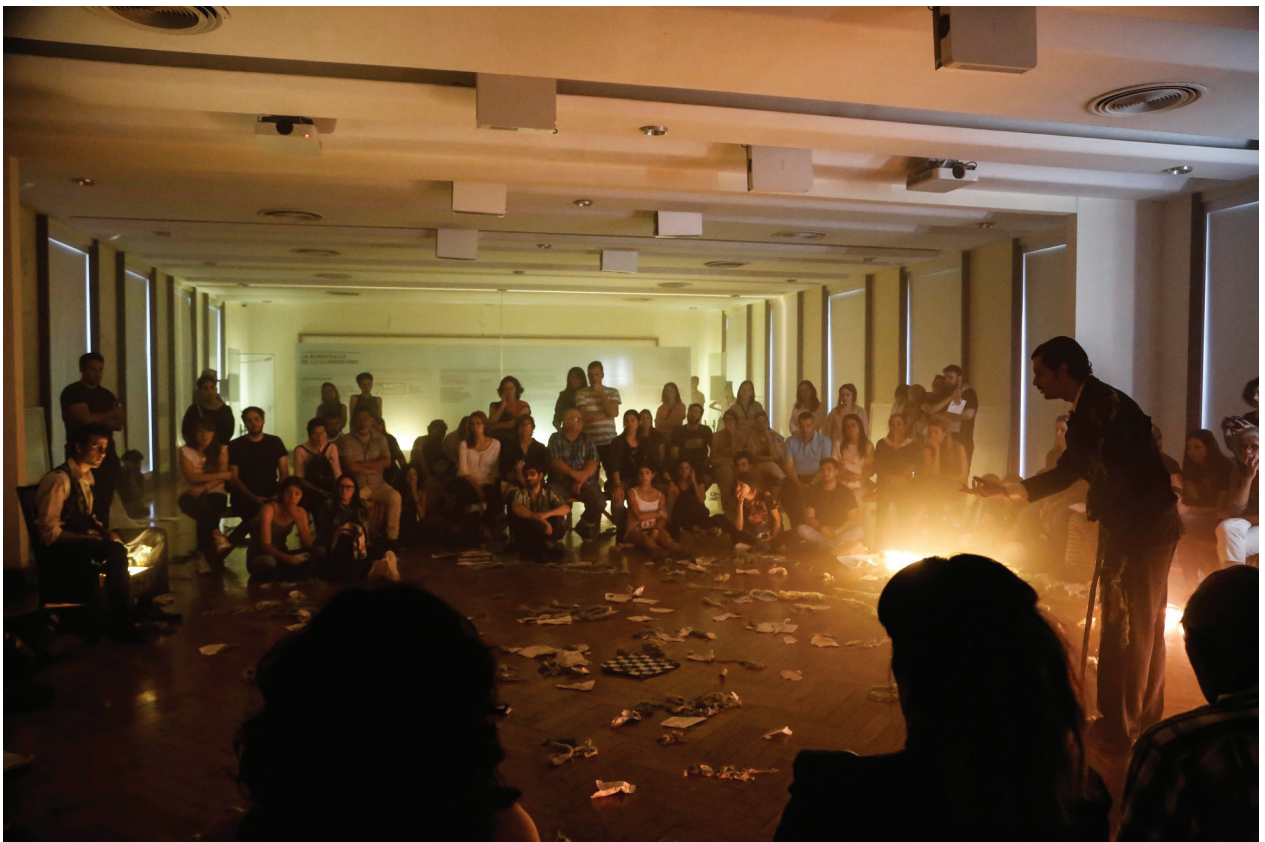
Figure 12. Voices of the River (ESMA Museum and Site of Memory).