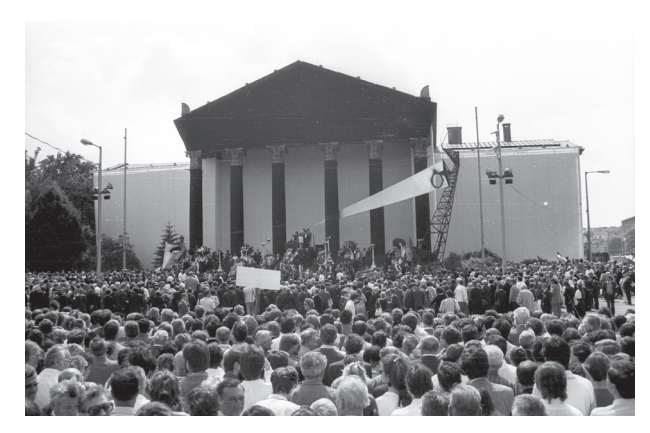
Figure 2. The rehabilitation of Imre Nagy and other martyrs in Heroes' Square, 16<sup>th</sup> June 1989.

site where Hungary's most important historical figures are memorialized. Additionally, the new location of the statue next to the former building of the ÁVH – which was complicit in crushing the uprising – insults the communist revolutionaries and abuses the memory of 1956, according to the petition.<sup>6</sup>