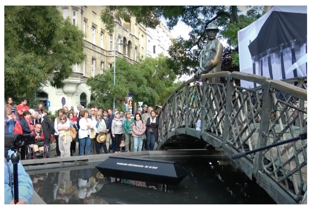
Figure 4. Still from the video documentation of the protest-performance, 2018.