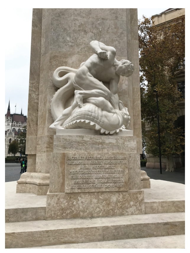
Figure 6. Memorial of the National Martyrs 1918–1919 in Martyrs' Square, 2019.

also because it is the site of the "bloody Thursday massacre," perhaps the most tragic event of the 1956 Revolution. Kossuth Square does not accommodate any visual evidence to the traumatic event other than the buildings that have since been renovated but the link between the past is visualized by the memorials commemorating the massacre. The subtle memorial dedicated to the victims of the "bloody Thursday" on 25th October 1956 represents symbolic bullets in bronze on the wall of the former Ministry of Agriculture and Rural Development on the corner of Martyrs' Square, designed in 2001 by sculptor József Kampfl and architect Ferenc Callmeyer, who himself was one of the survivors of the massacre. Since 2010, two more spectacular memorials were added to the square: a memorial pond with the inscription "Persecuted, but not forsaken; struck down, but not destroyed (2 Cor 4:9) In Memoriam October 25, 1956" ("Üldöztetünk, de el nem hagyatunk; tiportatunk, de el nem veszünk; 2 Kor 4:9 In Memoriam 1956. október 25.") and an underground memorial center, including a memorial and a permanent exhibition showcasing over sixty massacres across the country.10 While the memorials to the massacre are legitimate due to the site's past, the removal of the Imre Nagy Memorial signifies the withdrawal of the narrative about the fulfilment of the Revolution's objectives in 1989 – an aspect emphasized by the young Viktor Orbán in 1989, paradoxically. The Living Memorial articulated this ab-