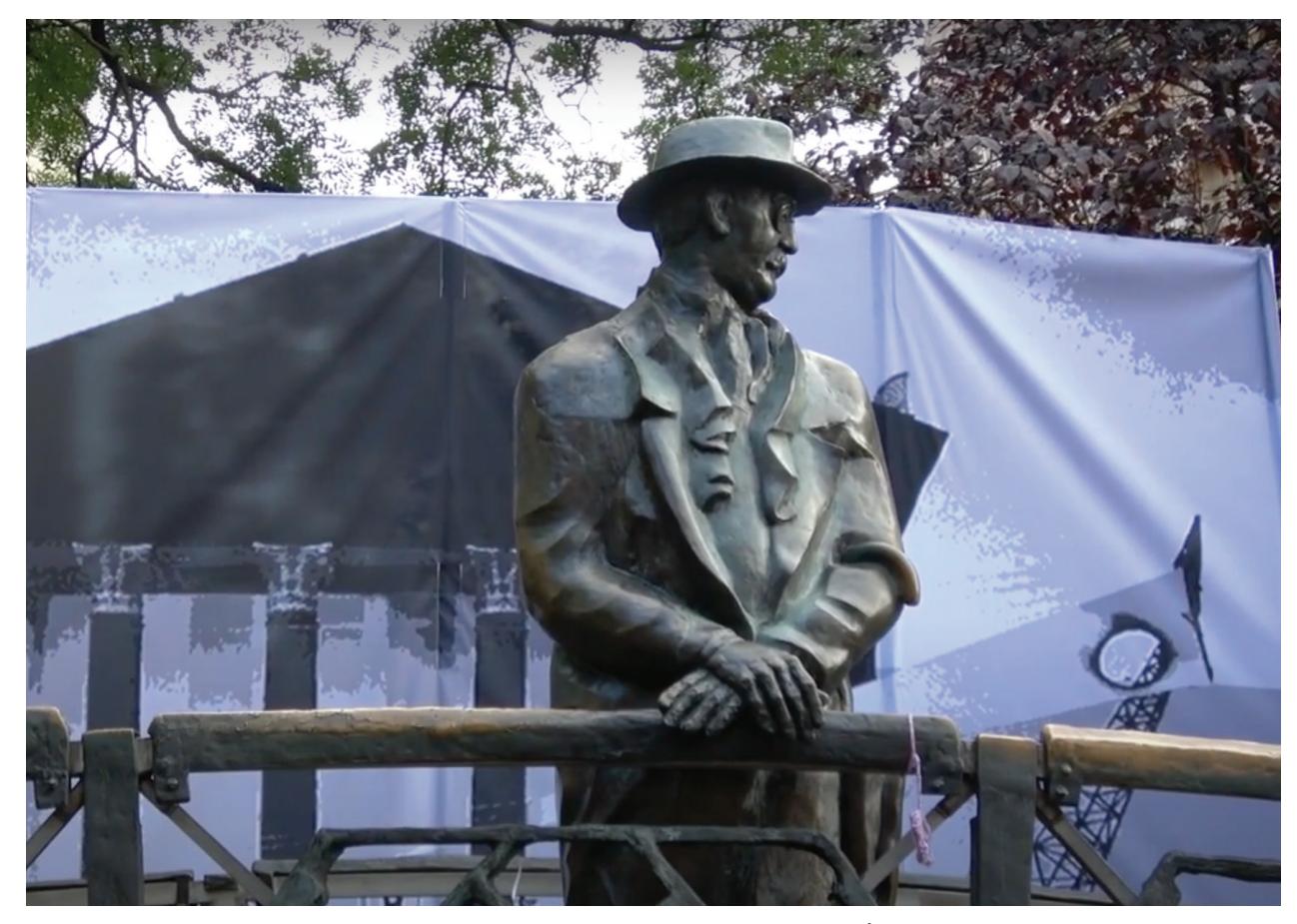
Figure 5. Still from the video documentation of the protest-performance, 2018.