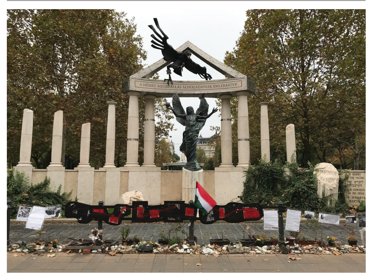
Figure 7. The German Occupation Memorial and objects placed in the frame of the Living Memorial, 2019.

those of slavery, the Holocaust, and colonialism – are not so easily separable from one another" (Rothberg 2011: 524). Post-socialist societies have been experiencing a vast wave of competing victimhood since 1989, which did not only concern local memory discourses but also challenged the dominant (Western) European paradigm. The different experiences of WWII and its aftermath between countries of the former Eastern Bloc and Western Europe accumulated in heated debates in the European Union, such as the one around the Prague Declaration (2008) and the subsequent EU resolution (2009) that equally recognized the victims of Communism, Nazism and fascism as victims of human rights violations committed by totalitarian regimes, which led to ongoing conflicts between the memory of the Holocaust (especially regarding its singularity) and other traumatic heritages within Europe. The notion of "multidirectional memory" aspires to overcome such competition to enable difficult but necessary discussions in this regard; however, the post-socialist region remains underrepresented in Rothberg's investigation. Looking at the Hungarian discourse through the lens of Rothberg's concept, which assumes that more memory generates more understanding and facilitates solidarity between victim groups may add intriguing insights into the dynamics of memory from an Eastern European perspective.