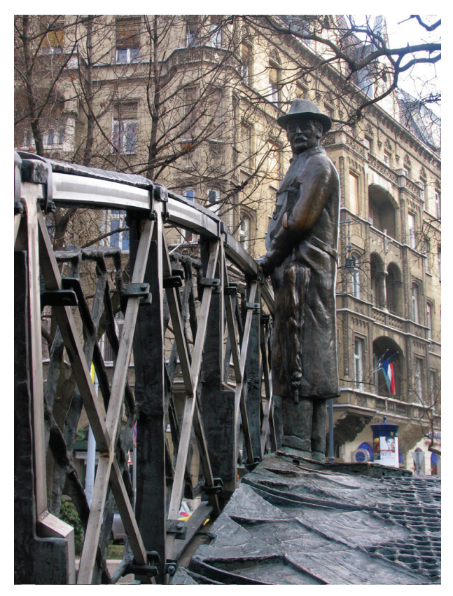
Figure 1. Imre Nagy Memorial in Martyrs' Square before its removal.

activists – both directly and indirectly – for showcasing a state-controlled, unidirectional historical narrative. For instance, Budapest's well-known "trauma site museum" (Violi 2012), the House of Terror Museum and the yet-to-be-opened House of Fates Holocaust museum represent the same problematic approach to history as the one that currently characterizes the government's memory politics. In this situation, the articulation of alternative memories by creative and artistic means takes place largely outside the state-sponsored institutions, and political art tends to serve as an aid of demonstrations to formulate and visualize counter-histories in opposition to the official narrative.