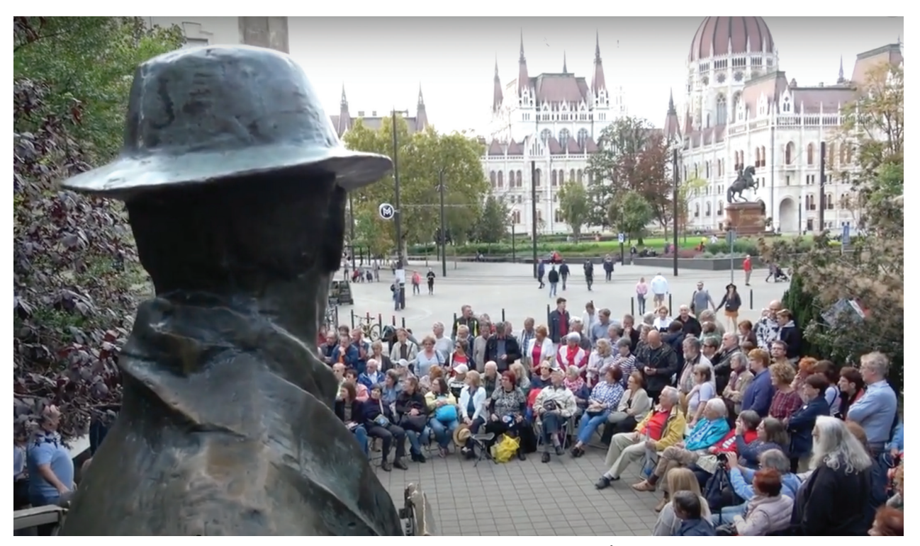
Figure 3. Still from the video documentation of the protest-performance, 2018 (Video: Ádám Csillag).

Western European historical experiences, and the lack of framing of post-socialist histories within the dominant (Western) European memory discourse. Regarding the 2018 protest, its fixed format and mixed genre (organized discussion, artistic performance, speeches) contribute to its complexity making it a unique example of memory activism, not to mention the fact that the performance mobilizes a very specific (and artistic) set of references that might not be easily decoded by the general, let alone the international public.