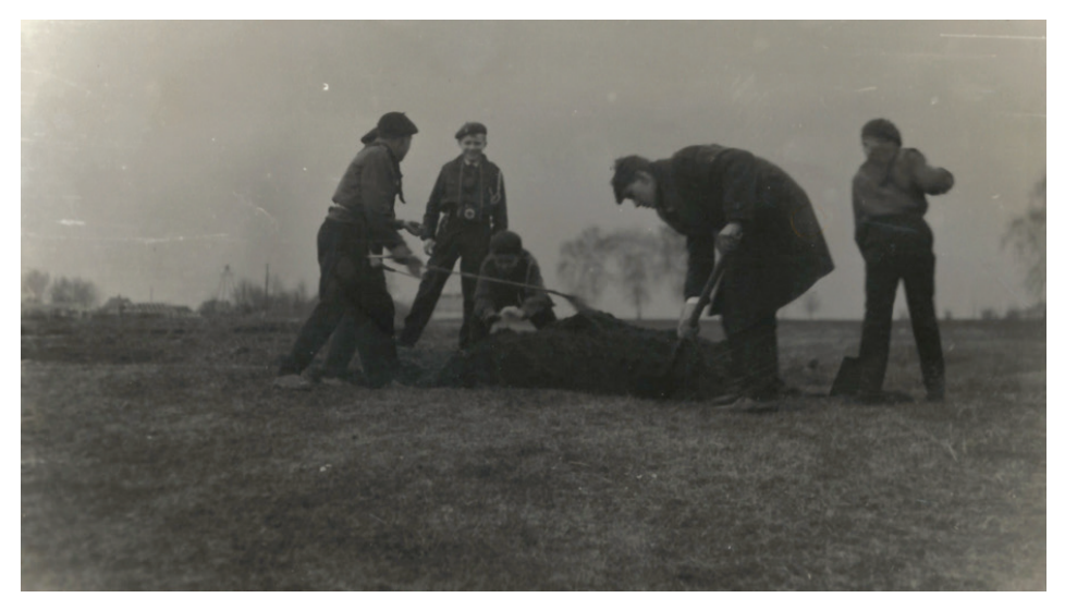
Figure 1. Photo attached to the report from the reconnaissance in Zamość (Zmość-Zamczysko). Caption on the back of the photo: "Scouts of troop no. 5 from Zamość build up the grave of an unknown Jew murdered by the Nazi invaders".