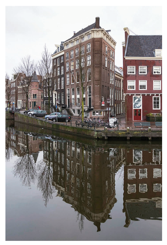
Figure 1. The Building Herengracht 401.

was a constituting feature of the group. After the war, the group needed internalisation of the group-defining forces that used to come from the outside to stay together as an alternative community. The war-time trauma was sublimated with a cult to maintain the feeling of togetherness and belonging only to bring back the pain much later in another shape and form.<sup>2</sup> With critical distance in time and space, some eyewitnesses were able to identify their pain as trauma. The complexity of the history in which it is rooted is so dense, that distance in time and culture makes it difficult to understand and empathetically connect with this history in a straightforward, unmediated way.